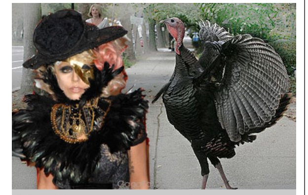
FIGURE 1: ALBANY-AREA TURKEY ACCOSTS GAGA: WANTS SHIRT BACK

Aside from the lone turkey sighting, there are lots of squirrels, which is fairly typical of anywhere on Earth with oak trees. Despite their alarmingly high numbers. I have yet to see one pancaked on the road, leading me to believe they have car radar built into their brains. If only people evolved the ability to avoid being hit by cars!